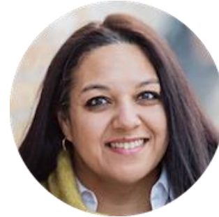
Kapila Vigés MPN Research Foundation, USA